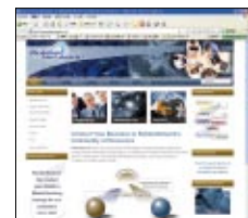
Rubber Network website

Yokohama Rubber has participated in the e-procurement system called "Rubber Network" since 2001 to reduce costs through joint procurement and auctions on the Internet. E-procurement is open to the public globally and is characterized by its transparency. Yokohama Rubber uses the network for a wide range of items, including packaging materials and pallets, electric parts, air-conditioning equipment and office supplies.