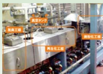
Recycling system at Mie Plant (biaxial screw extractor)

At our Mie Plant, a new mass material recycling system has been introduced to reuse vulcanized rubber waste generated during the production process as raw material for tire products, and mass production of recycled material began in earnest in January 2007. This technology does away with the need for chemical processing using chemical agents, and allows the points of crosslinkage of the vulcanized rubber to be selectively decoupled, making it possible to recycle high-quality rubber with workability and physical properties that are almost on a par with new rubber.